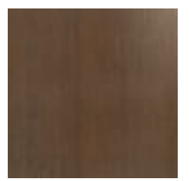
Australian Eucalyptus Dark Oil