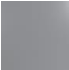
Core Powder-Coat Silver Pearl Satin Metallic