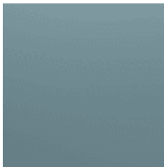
Signature Powder-Coat Wedgewood Satin