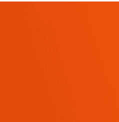
Bold Powder-Coat Pure Orange Satin