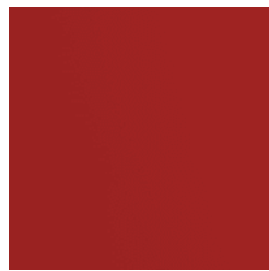
Bold Powder-Coat Carmine Red Satin