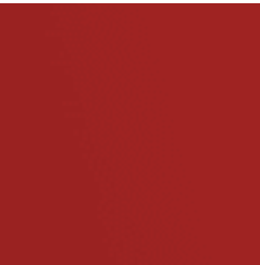
Bold Powder-Coat Carmine Red Satin