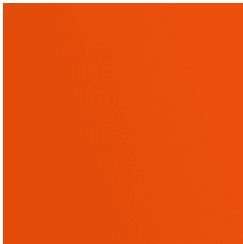
Bold Powder-Coat Pure Orange Satin