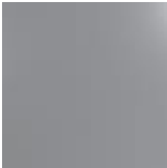
Core Powder-Coat Silver Pearl Satin Metallic