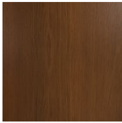
Hardwood Australian Eucalyptus Dark Oil