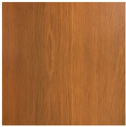
Hardwood Australian Eucalyptus Light Oil