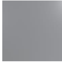
Core Powder-Coat Silver Pearl Satin Metallic