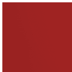
Bold Powder-coat Carmine Red Satin