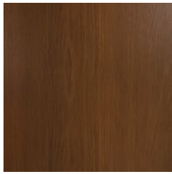
Hardwood Australian Eucalyptus Dark Oil