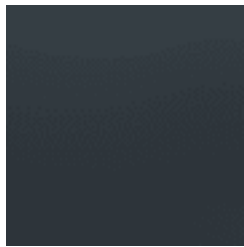
Signature Powder- Coat Deep Ocean Satin