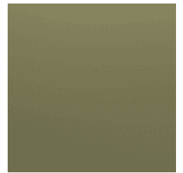
Signature Powder- Coat Mangrove Satin