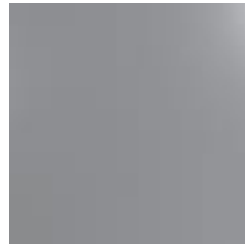
Core Powder-Coat Silver Pearl Satin Metallic