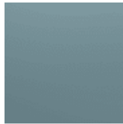
Signature Powder- Coat Wedgewood Satin