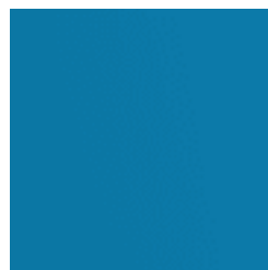
Bold Powder-Coat Sky Blue Satin